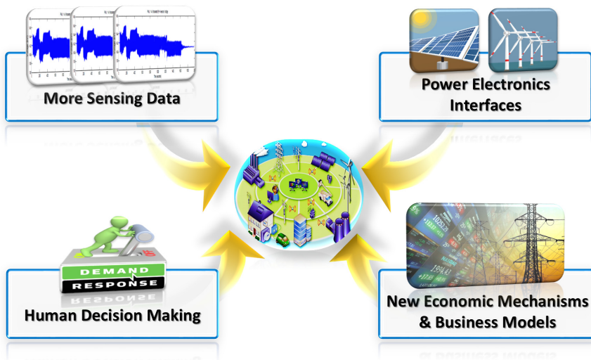
Figure 1.2: Overview of a possible Grid 3.0 research agenda.

The objective of this monograph is to present the research problems in the new era of Grid 3.0, as well as possible research opportunities that could pave the way for such a transition. The key is to leverage the pervasive data, control, communication, and computation capabilities, that are becoming available at the end-user household interface, and to provide an engineering and economics model and solution for them to provide, rather than only consume a variety of services that are critical to the reliability of the grid operation. Figure 1.2 describes the authors' view of a possible research agenda.